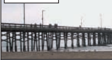
Newport Beach Pier